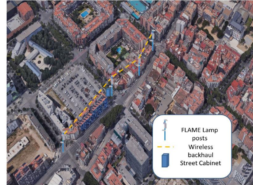
FLAME platform in Millennium Square